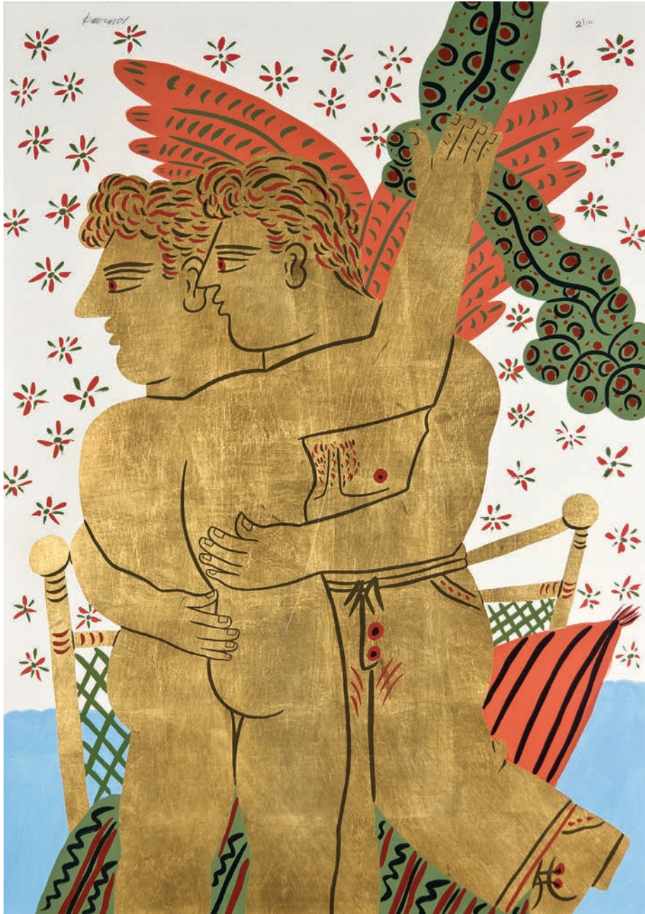
GOLDEN ANGEL OF LOVE (Ltd. edition of 10)

mixed media with gold leaves on paper mounted on canvas 125 x 88 cm