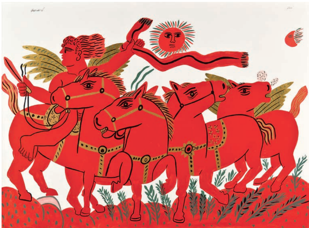
THE RED HORSES OF APOCALYPSIS (Ltd. edition of 10) mixed media on paper mounted on canvas 92 x 124 cm