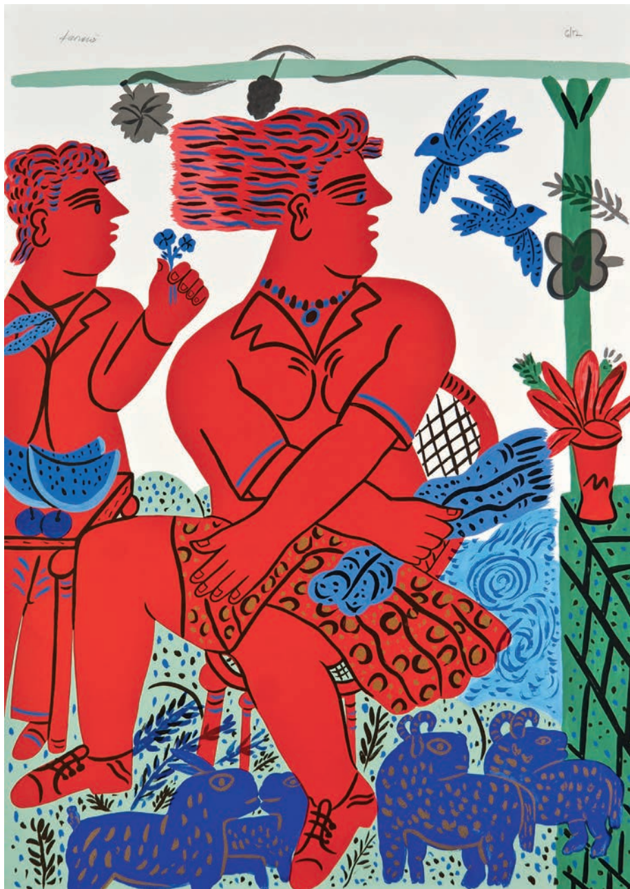
RED FRIENDSHIP (Ltd. edition of 12) mixed media on paper mounted on canvas 125 x 89 cm