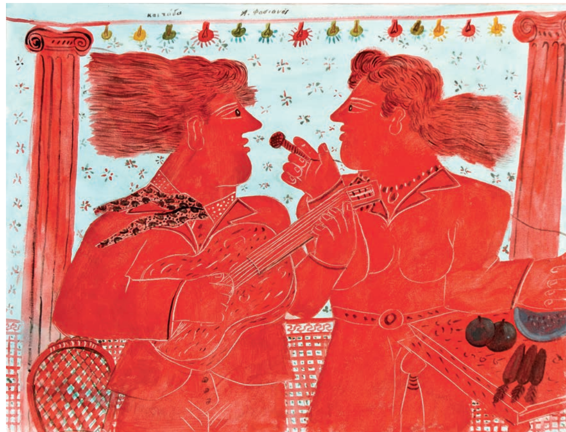
SERENADE acrylic on canvas 67 x 87 cm