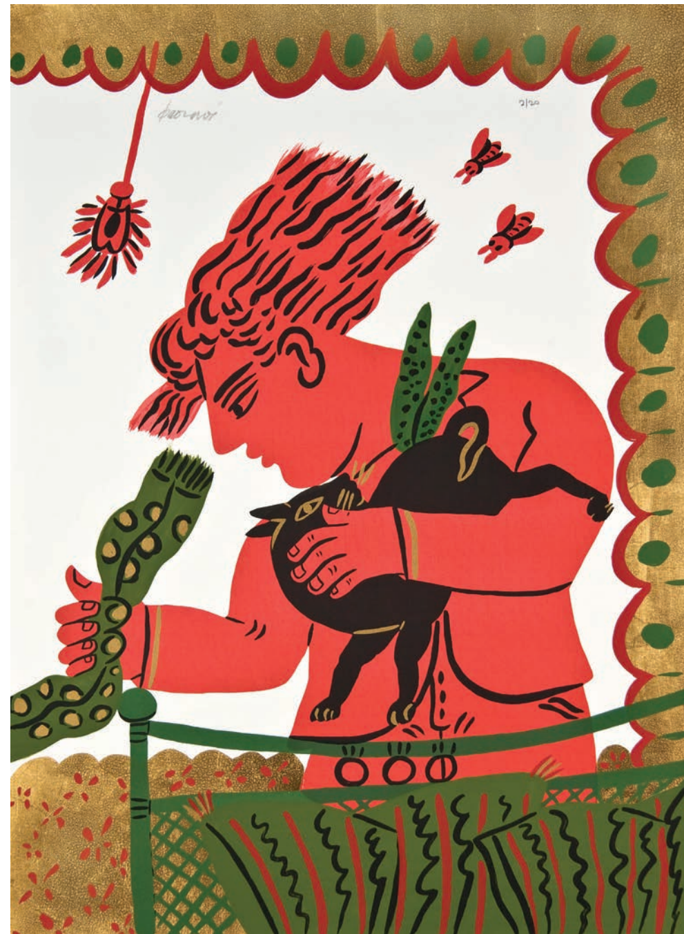
THE CAT (Ltd. edition of 20) mixed media on paper mounted on canvas 90 x 65 cm