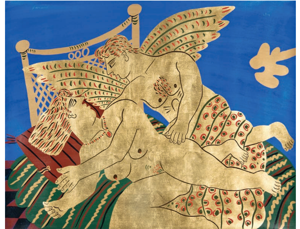
EROTIC GOLD (Ltd. edition of 14) mixed media with gold leaves on paper mounted on canvas 90 x 115 cm