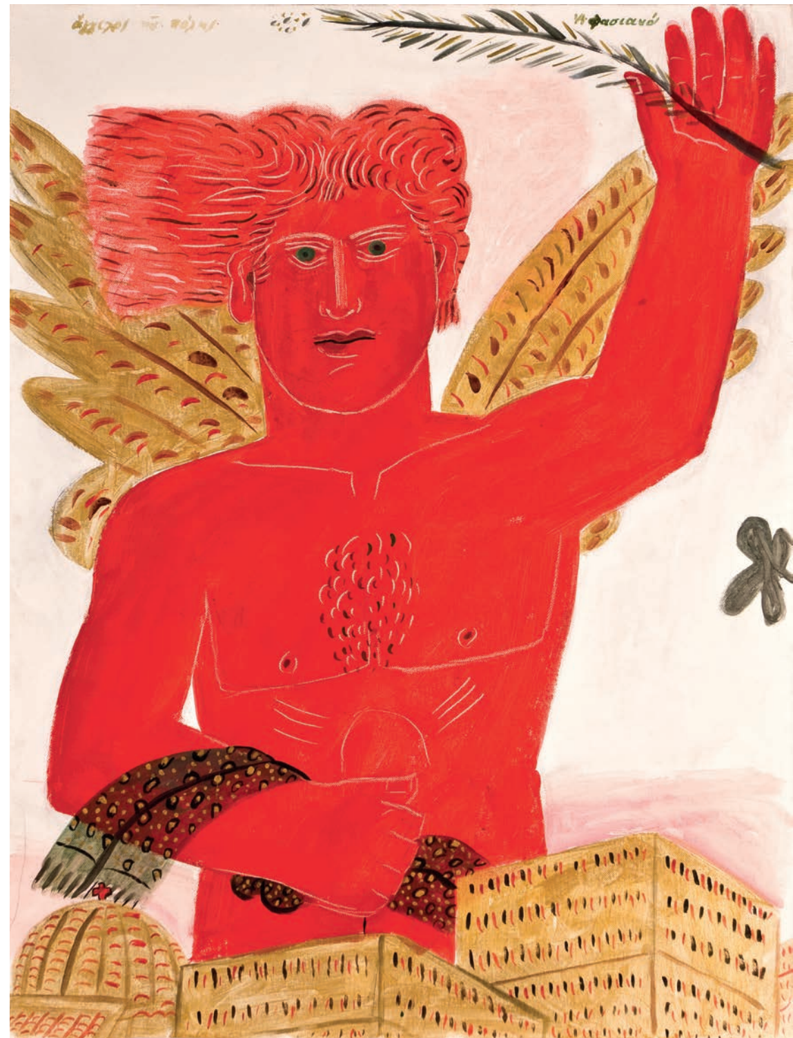
ANGEL OF TOWN acrylic on canvas 73 x 55 cm