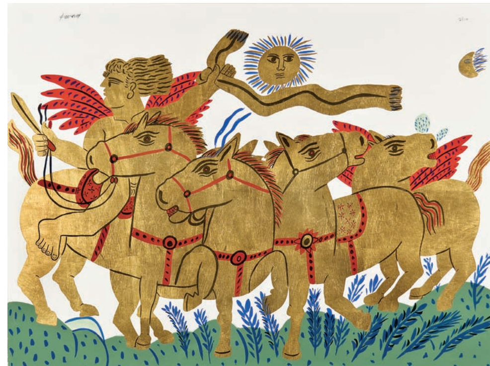
THE GOLD HORSES OF APOCALYPSIS (Ltd. edition of 10) mixed media with gold leaves on paper mounted on canvas 92 x 124 cm