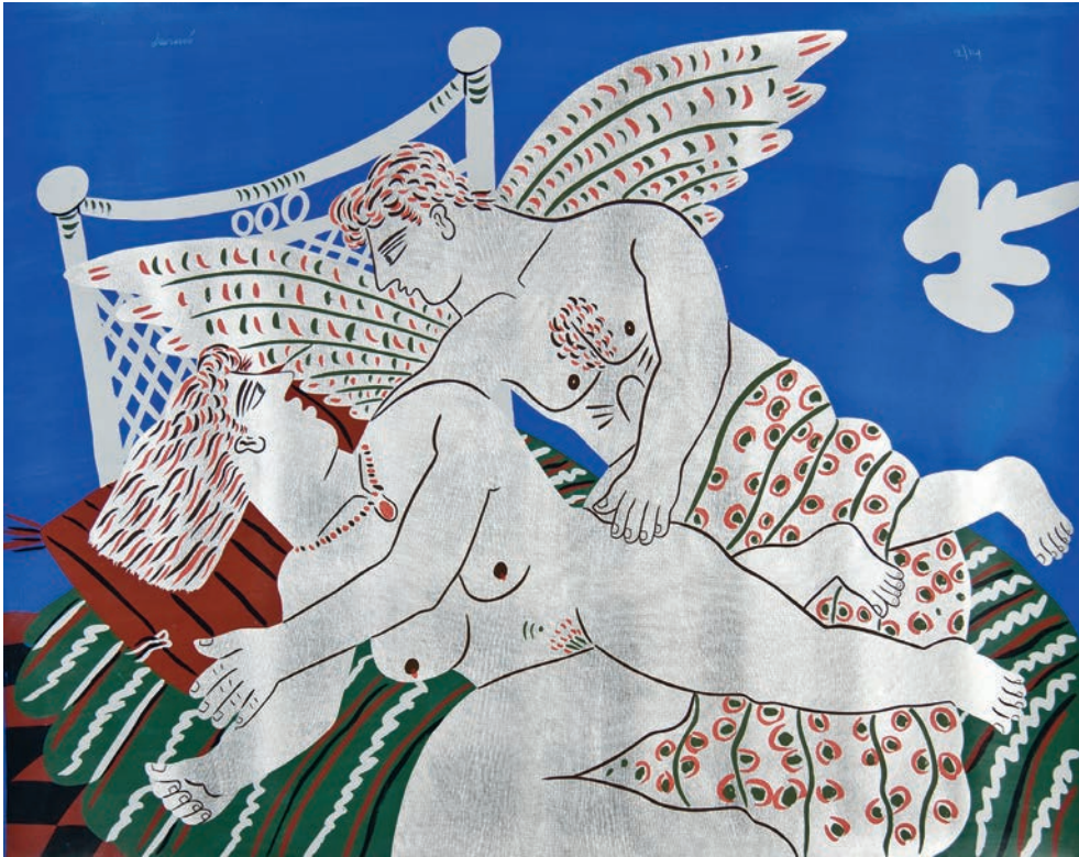
EROTIC SILVER (Ltd. edition of 14) mixed media with silver leaves on paper mounted on canvas 90 x 115 cm