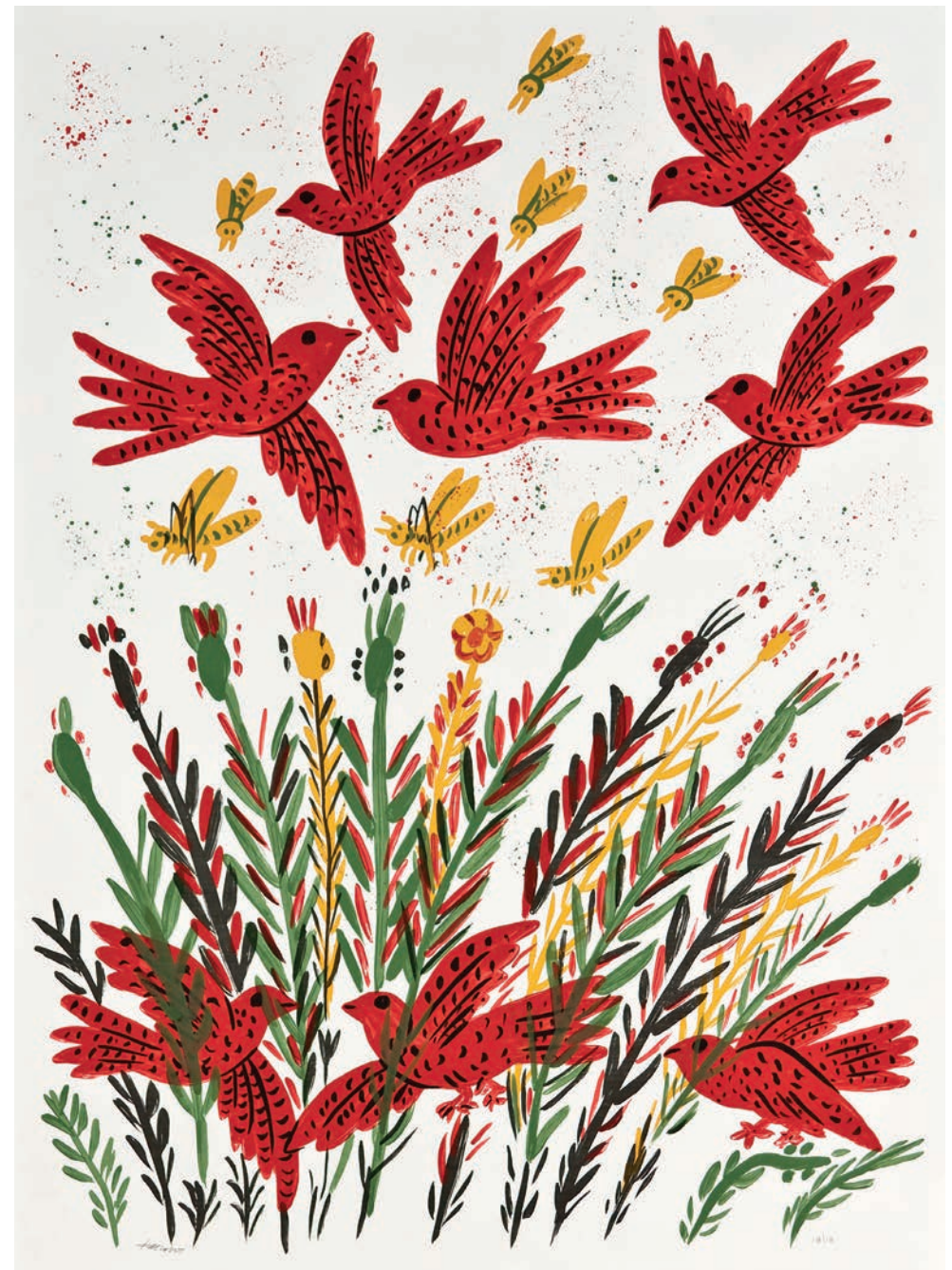
THE BIRDS (Ltd. edition of 18) mixed media on paper mounted on canvas 130 x 95 cm