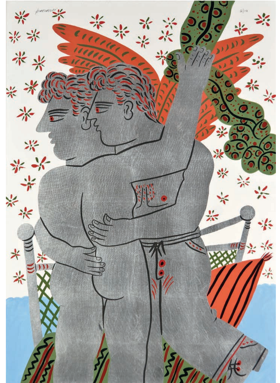
SILVER ANGEL OF LOVE (Ltd. edition of 10)

mixed media with gold leaves on paper mounted on canvas 125 x 88 cm