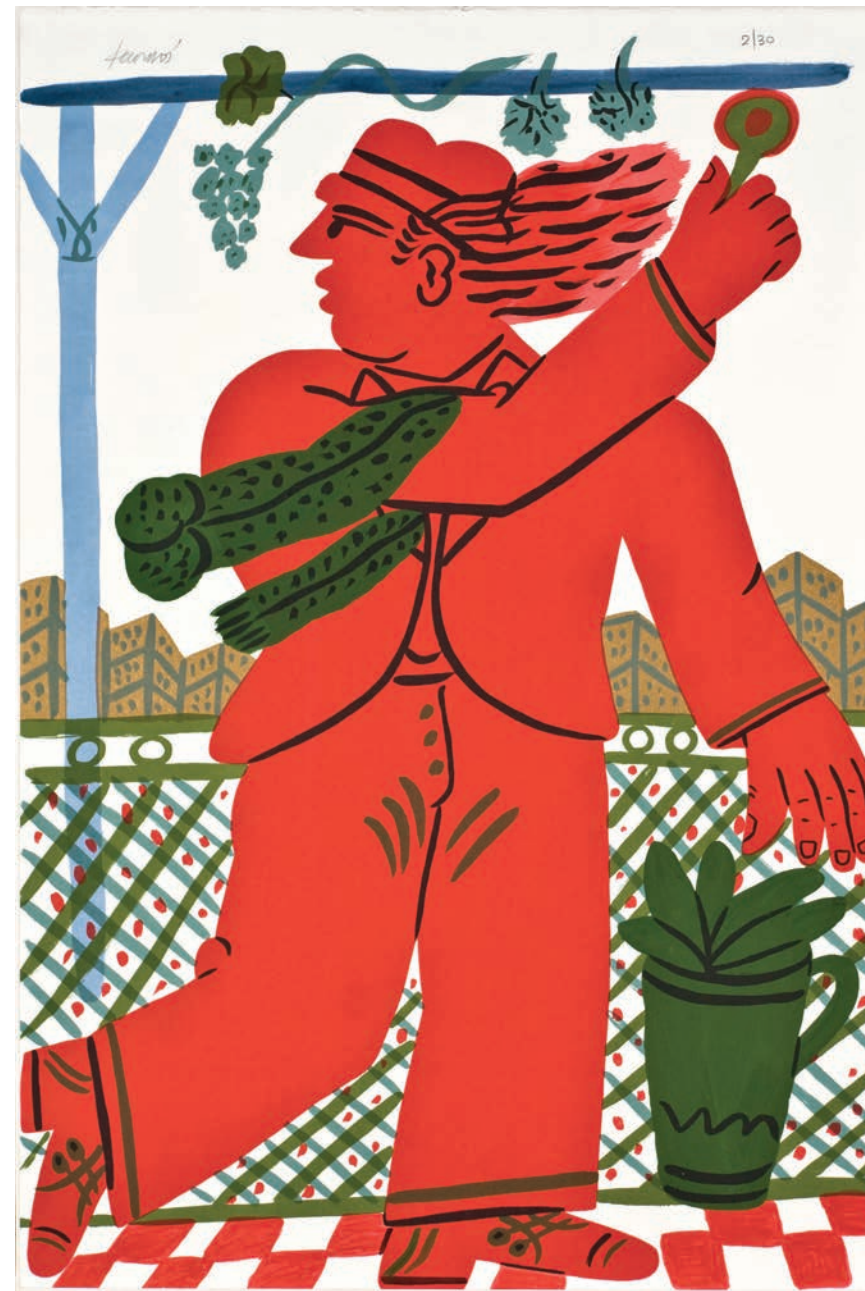
IN THE ARBOR (Ltd. edition of 30) mixed media on paper mounted on canvas 66 x 44 cm