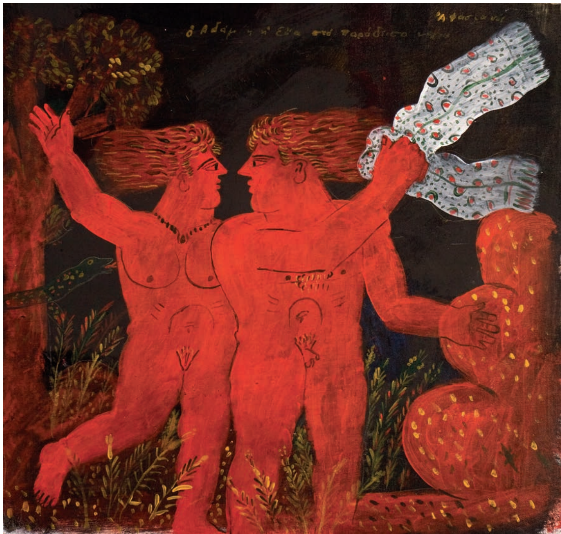
ADAM AND EVE IN NIGHTY PARADISE