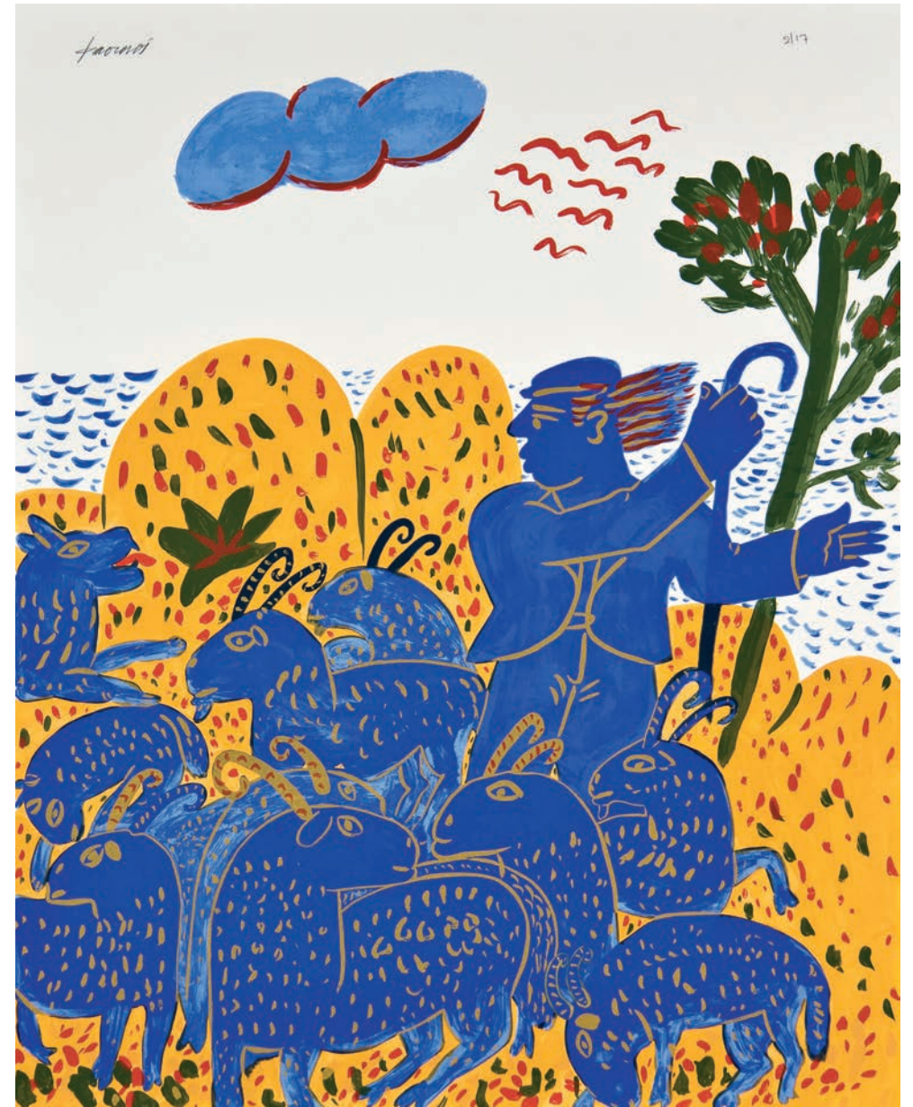
THE BLUE SHEEPS (Ltd. edition of 17) mixed media on paper mounted on canvas 83 x 66 cm