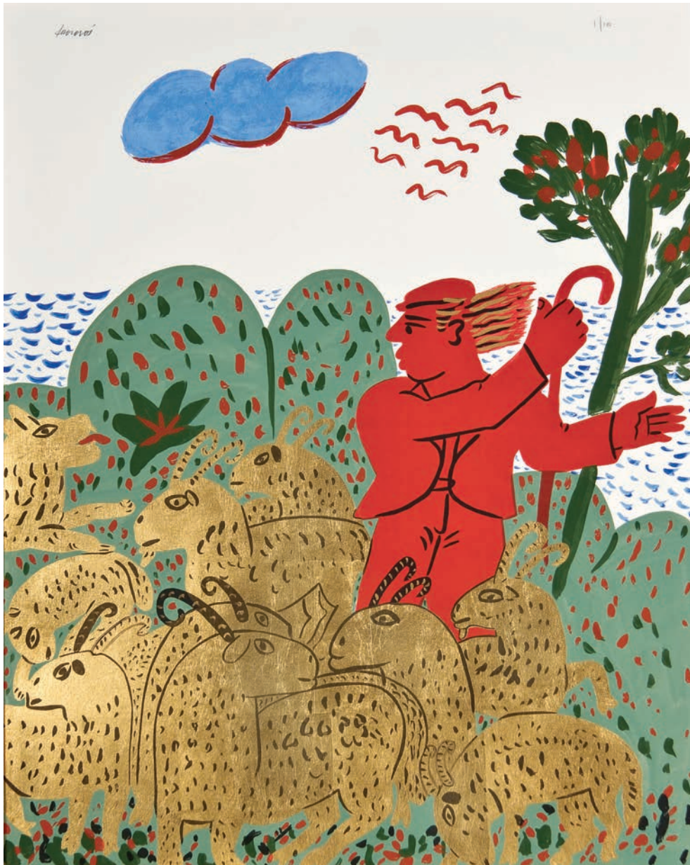
THE GOLDEN SHEEPS (Ltd. edition of 10) mixed media with gold leaves on paper mounted on canvas 83 x 66 cm